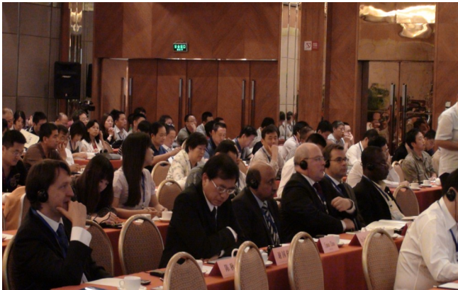
▲ Meeting Attendants